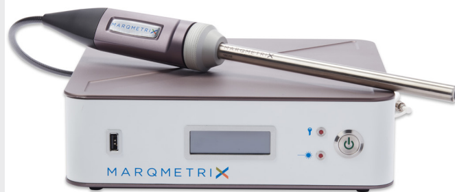
MarqMetrix® All-In-One Raman System

A MarqMetrix® Raman spectrometer eliminates all of these additional costs while offering superior analysis that requires NO calibration – ever.